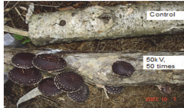
Fig. 2 Typical photograph of the cultured L. edodes with and without electrical stimulation.

kinds of fruit and vegetable emit the ethylene gas which accelerate a degradation of other kind fruits and vegetables. The repetitive \mu s-pulse DBD remediation of air and liquid to inhibit degradation of agricultural products via ethylene removal via oxidization reaction [7].