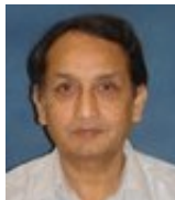
AAPPS-DPP chair & 2024 IOC chair Abhijit Sen

AAPPS-DPP ( http://aappsdp.org/AAPPSDPP/ ) is organizing body of this conference. MIP co-organizes this conference and acts as LOC.