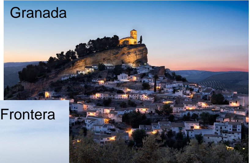
Vejer de la Frontera